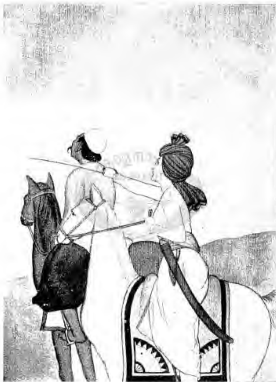
"In the twinkling of an eye, cut off the robber's head."